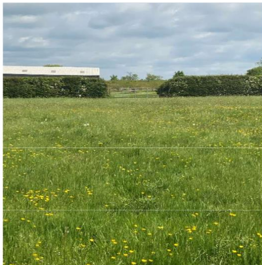
View from Footpath to gate